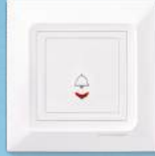
6A Bell Push with Indicator - 2M