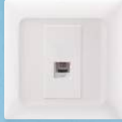
Tel. Socket - RJ11