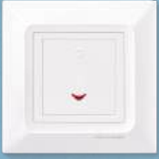
20A/32A DP Switch