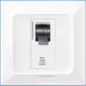
Mini MCB SP C-16