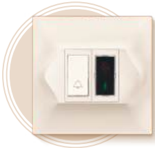
DND External Unit