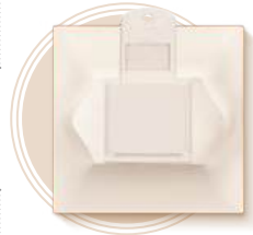
32A Mechanical Key Tag