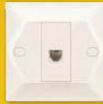
Telephone Socket RJ 11