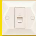
Computer Socket RJ 45