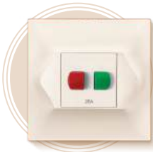
25A Motor Starter

An exciting new range that enhances your product lineup.