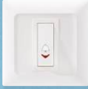
6A Bell Push with Indicator - 1M