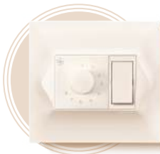
Fan Regulator - 2M 8 Steps