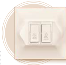
DND Internal Unit