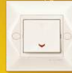
32A DP Switch with Indicator