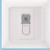
Bell Call Indicator