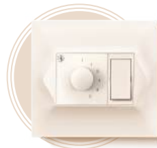
Fan Regulator - 2M 5 Steps