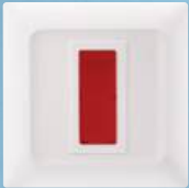
Flat Indicator Red