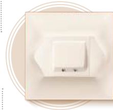
Skirting Light - 2M