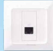
Computer Socket RJ45 Cat. 6