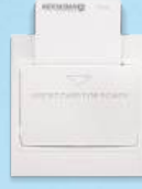
Key card Switch 16A

Our switches are compliant with revised BIS standard (IS 3854:2023) requirements. Also, our switches are covered additionally for use on Self-Ballasted Lamp (SBL) loads.