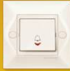
6A Bell Push with Indicator