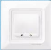
Skirting Light - 2M