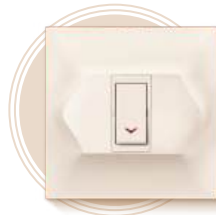
25A switch with Indicator