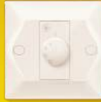
Fan Step Regulator 100W