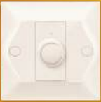
Light Dimmer 400W