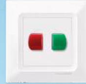
25A Motor Starter